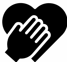
Honesty & Integrity